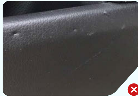
Holes to the interior upholstery and trim and not acceptable.