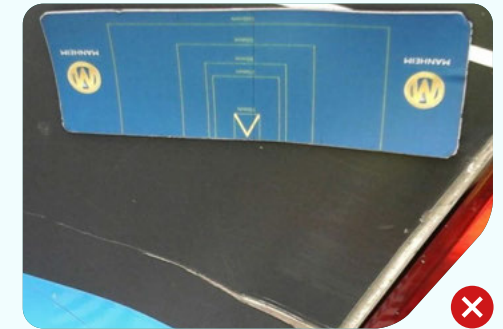
Any scratch where the primer or base metal is shown will also be charged.

Black and white striped boards (zebra boards) are often reflected in the body panel. The stripes distort when there is a dent on the panel making it easier to see in a photograph.