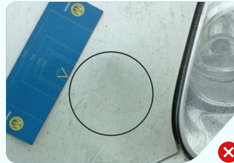
Dents over 15mm in diameter, or any dents to the roof or swage line on any panels, are not acceptable.