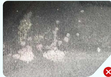
The interior of the vehicle must be clean and odourless with no burns, scratches, tears, dents or staining.