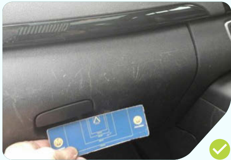
Scratches that reflect normal use are acceptable.