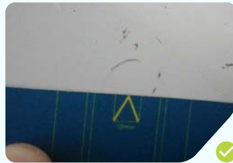
Scratches that reflect normal use are acceptable.