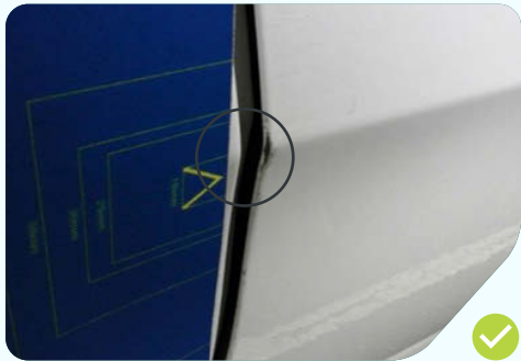
Small areas of chipping, including door edge chipping, are acceptable.